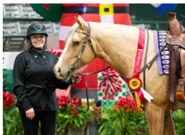
WDAA Res Champ