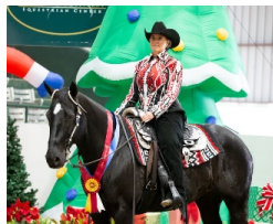
WDAA Res Champ